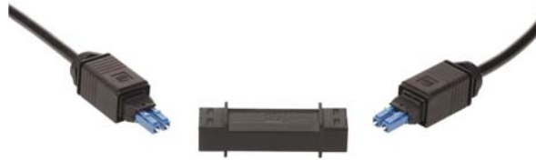
Fig. 2: PushPull adapter for LC duplex fiber optic cable