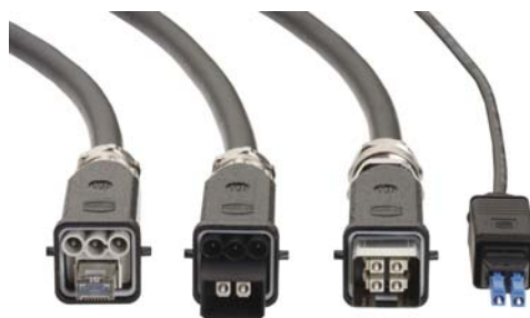
Fig. 3: HARTING outdoor solutions

A separate wiring with PushPull connectors offers the additional advantage of standardised connector interfaces (IEC 61076-3-106 for the PushPull RJ 45, in the future IEC 61754-20-11 for the PushPull LC duplex) and the use of the same housing cut-out for data and power.