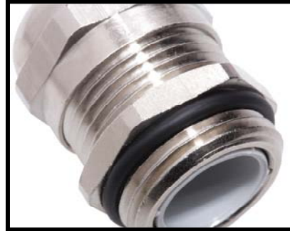
Special outdoor seal – still in perfect condition after the ozone/UV tests