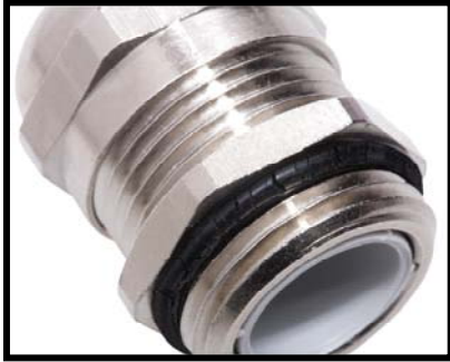
Standard seal – porous after the ozone/UV tests